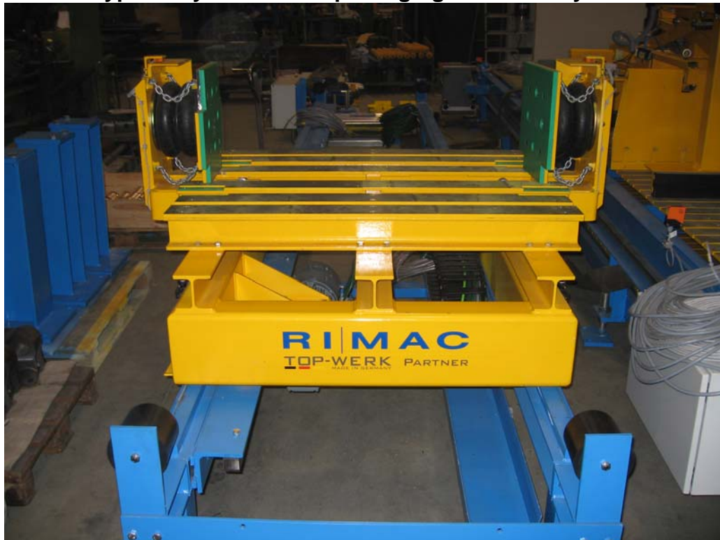
RSP Modul compactor and transfer station